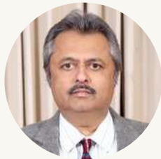
HON'BLE SHRI JUSTICE RAVI MALIMATH

Hon'ble The CHIEF JUSTICE, High Court of Madhya Pradesh & CHANCELLOR, DNLU