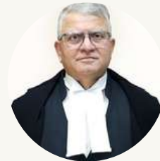
HON'BLE SHRI JUSTICE CHAKRADHARI SHARAN SINGH

Hon'ble The CHIEF JUSTICE, High Court of Madhya Pradesh & CHANCELLOR, DNLU