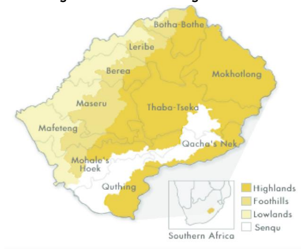
Figure 1: Lesotho Ecological Zones

Once Lesotho experiences climatic fluctuations, the water bodies, roads, and bridges are adversely affected thereby restricting the movement of people and animals. The limited movement of people and animals affects Lesotho's exports negatively in the global market because of limited economic activities. The net effects are reduced balance of payments and livelihoods of local communities since almost 80% rely on subsistence agriculture. As per the Integrated Food Security Phase Classification (IPC) Acute Food Insecurity analysis (2024), it is estimated that approximately 293,000 people in rural Lesotho (19 percent of the population) are facing severe food insecurity, classified as IPC Phase 3(Crisis) or worse, from May to September 2024.